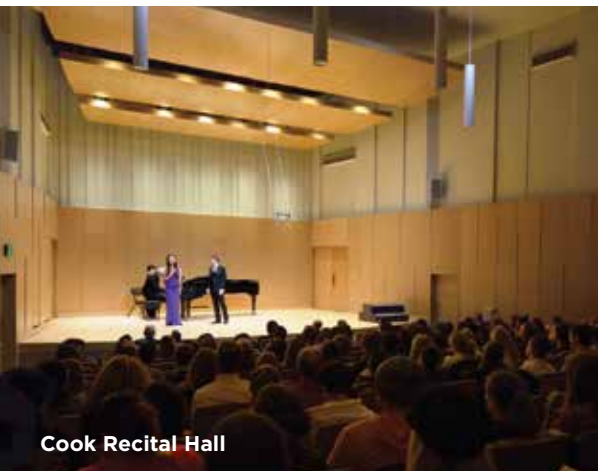
Cook Recital Hall

Historic Cook Recital Hall is the heart of performance life in the College of Music. The intimate 182-seat venue has been completely renovated to meet contemporary performance standards, and is used for student rehearsals, recitals, faculty concerts, and master classes. Part of the Billman Music Pavilion expansion, Murray Hall serves as both a rehearsal and performance space. For the principal use of jazz, the venue accommodates 156 patrons with 130 seats on the first level and 26 in the balcony.