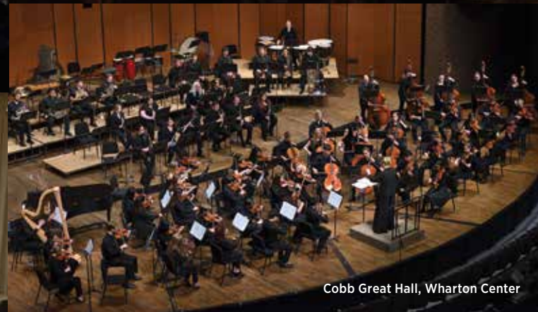
Cobb Great Hall, Wharton Center

MURRAY HALL BILLMAN MUSIC PAVILION MUSIC BUILDING Capacity: 156 (130 main floor, 26 balcony) 333 West Circle Drive