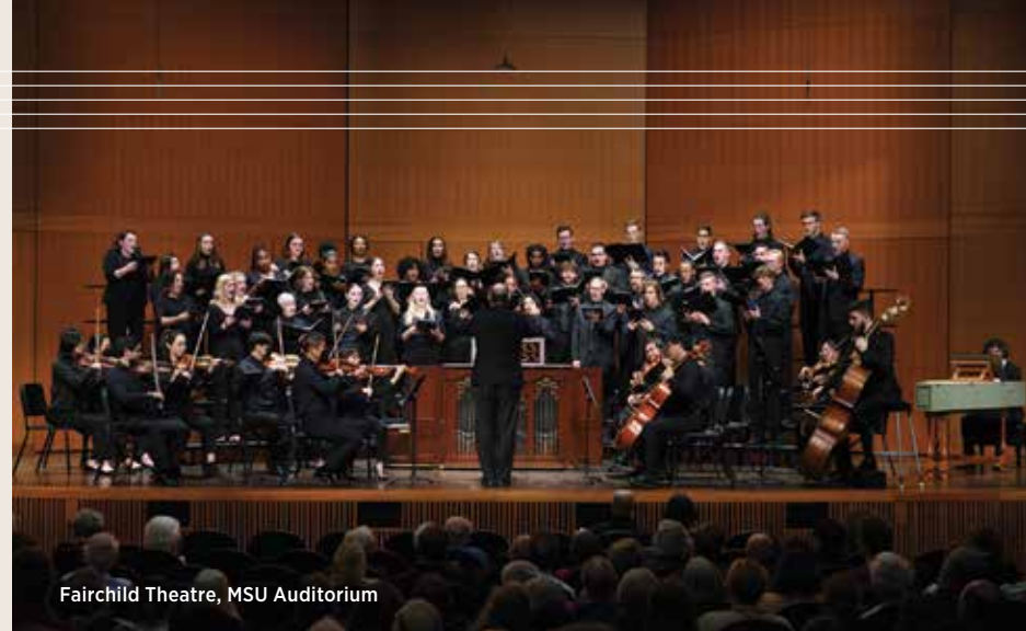
Fairchild Theatre, MSU Auditorium