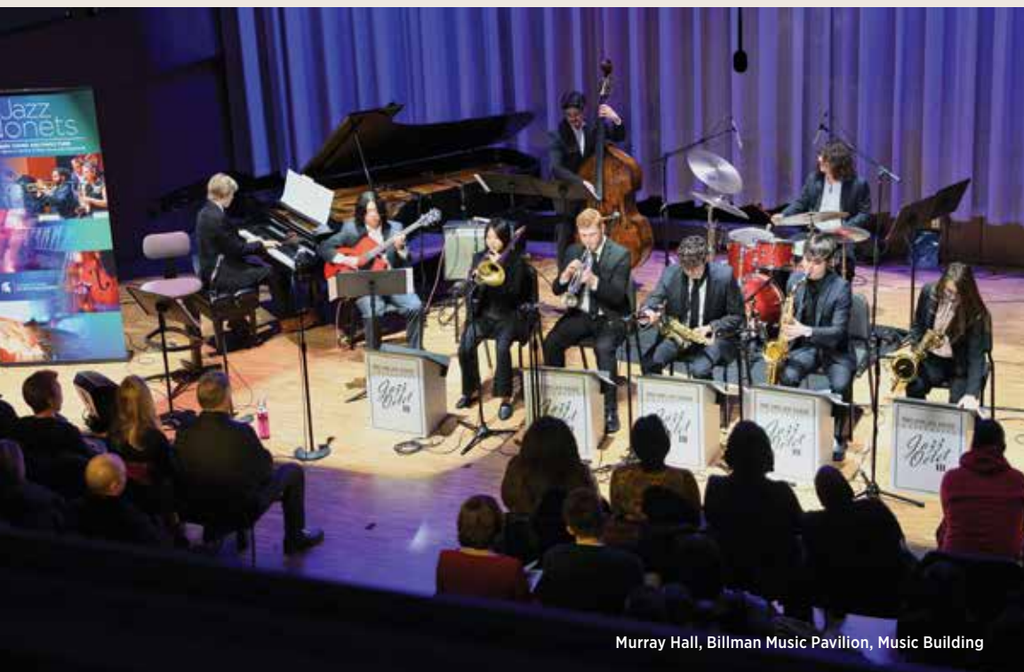
Murray Hall, Billman Music Pavilion, Music Building

In addition, a beautiful new state-of-the-art pipe organ is a focal point of the recently renovated MSU Alumni Memorial Chapel. Adorning the interior and enveloping small audiences in choral and sacred repertoire, the Red Cedar Organ was privately funded and custom-made for the space.