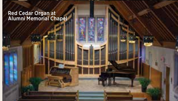
Red Cedar Organ at Alumni Memorial Chapel