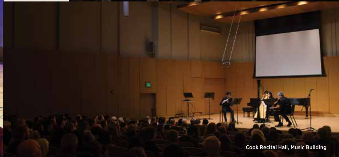
Cook Recital Hall, Music Building