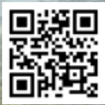
VICTORY FOR MSU